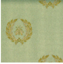
4035-02 LAMPAS AIGLON - VERT