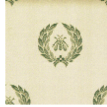
4035-07 LAMPAS AIGLON - CREME VERT