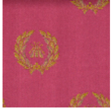
4035-01 LAMPAS AIGLON - ROUGE