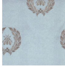
4035-06 LAMPAS AIGLON - NATTIER *