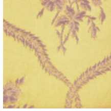
4036-06 LAMPAS FRAGONARD - TOISON