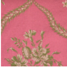
4036-03 LAMPAS FRAGONARD- FRAMBOISE