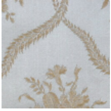
4036-02 LAMPAS FRAGONARD - LOTUS