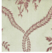
4036-04 LAMPAS FRAGONARD - FLEUVE *