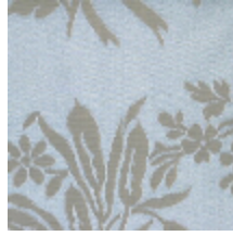
4042-12 DAMAS AMBOISE - BLEU BIS