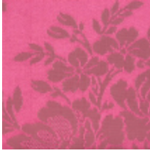
4042-08 DAMAS AMBOISE - FRAISE BIS