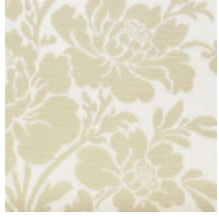
4042-01 DAMAS AMBOISE - BLANC