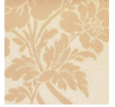
4042-13 DAMAS AMBOISE - ECUME *