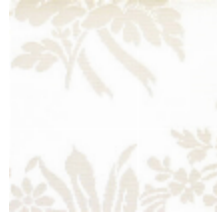
4042-19 DAMAS AMBOISE - NEIGE