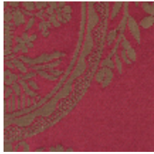
4048-32 RAMBOUILLET - ROUGE/BIS *