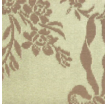
4048-21 RAMBOUILLET - VERT/BIS