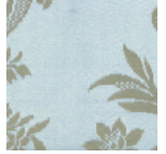
4048-27 RAMBOUILLET - NATTIER BIS