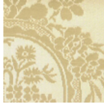
4048-23 RAMBOUILLET - ECUME