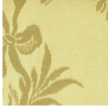
4048-02 RAMBOUILLET - PAILLE