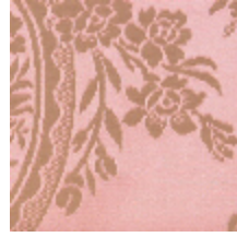
4048-24 RAMBOUILLET - ROSE OLIVE