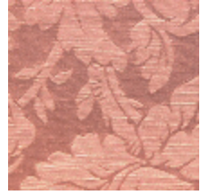
4050-23 DAMAS DELACROIX - ROSE