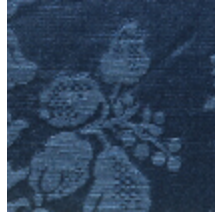
4050-13 DAMAS DELACROIX - MARINE