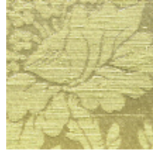
4050-14 DAMAS DELACROIX - TILLEUL