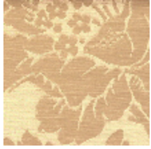
4050-02 DAMAS DELACROIX - CREME