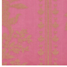
4052-08 VALOGNES - ROSE *