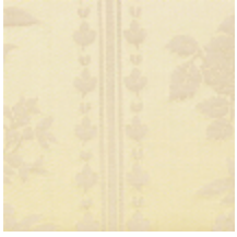
4052-03 VALOGNES - JAUNE *