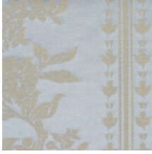
4052-07 VALOGNES - AZUR *