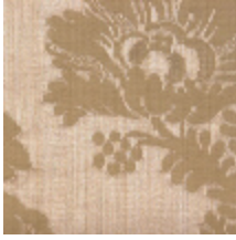
4062-02 DAMAS ORSAY - CREME *