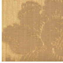
4062-03 DAMAS ORSAY - MORDORE *