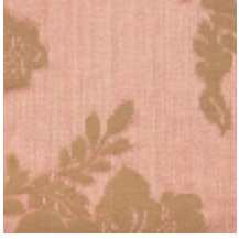
4062-01 DAMAS ORSAY - ROSE *