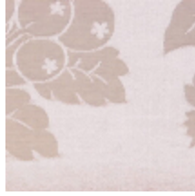
4072-07 DAMAS VALENCAY- EGLANTINE *