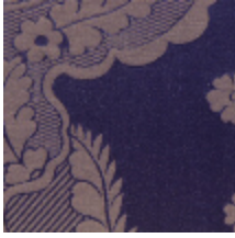
4072-02 DAMAS VALENCAY-NUIT *