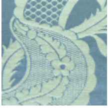
4072-01 DAMAS VALENCAY-AZUR *