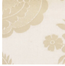
4072-08 DAMAS VALENCAY- NACRE *