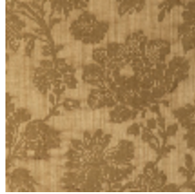
4083-04 ELOISE-MARRON GLACE