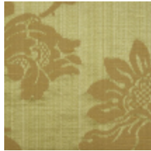
4083-06 ELOISE- CHARTREUSE *