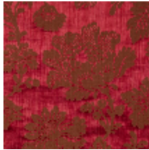
4083-10 ELOISE- RUBICOND