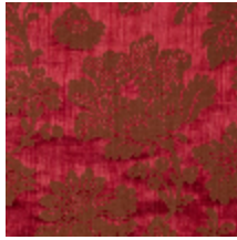
4083-10 ELOISE- RUBICOND