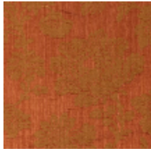
4083-09 ELOISE- CORNALINE