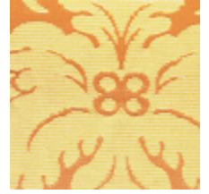
4120-06 DAMAS ORION - TOURMALINE *