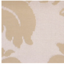
4120-07 DAMAS ORION - QUARTZ *