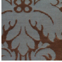
4120-01 DAMAS ORION - MALACHITE