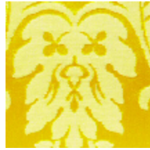
4120-09 DAMAS ORION - TOPAZE