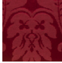
4120-04 DAMAS ORION - RUBIS