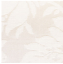
4120-08 DAMAS ORION - ALBATRE *