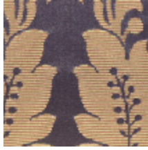
4120-02 DAMAS ORION - MAGNETITE