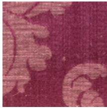
4128-08 DAMAS TOURNELLE - FRAMBOISE