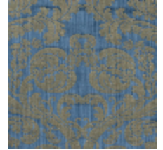
4128-06 DAMAS TOURNELLE - ROY