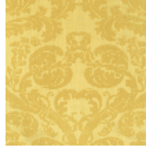
4128-04 DAMAS TOURNELLE - OR