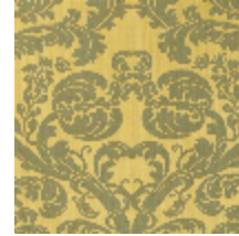
4128-05 DAMAS TOURNELLE - OR/BLEU