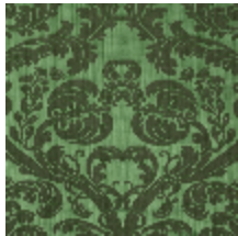
4128-07 DAMAS TOURNELLE - EMERAUDE