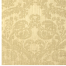
4128-02 DAMAS TOURNELLE - BEIGE