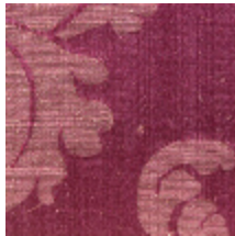
4128-08 DAMAS TOURNELLE - FRAMBOISE