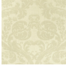
4128-01 DAMAS TOURNELLE - COQUILLE