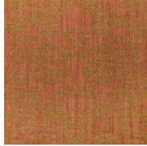
4128-03 DAMAS TOURNELLE - CUIVRE