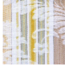
4139-05 LOURMARIN- BEIGE/COQUILLE