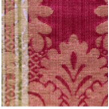
4139-01 LOURMARIN- BORDEAUX/VIEIL OR