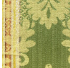
4139-03 LOURMARIN- MOUSSE/TOMETTE