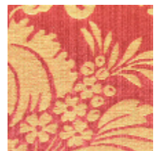
4140-07 GRAMBOIS - TOMETTE