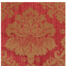
4140-01 GRAMBOIS - BORDEAUX