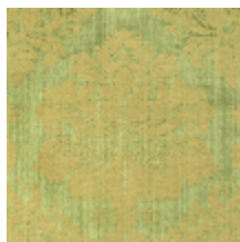
4140-03 GRAMBOIS - MOUSSE