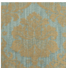
4140-02 GRAMBOIS - NATTIER