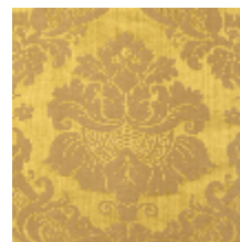
4140-06 GRAMBOIS - VIEIL OR