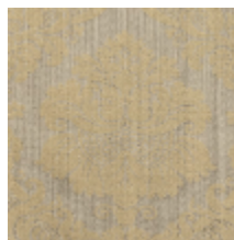
4140-04 GRAMBOIS - ARGENT *