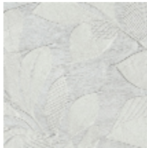
4222-02 PHYLUM - QUARTZ *