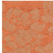
4222-04 PHYLUM - PAPAYE *