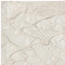
4222-01 PHYLUM - ALBATRE *