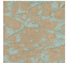
4222-06 PHYLUM - MENTHE *