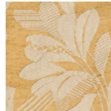
4222-05 PHYLUM - GENET *