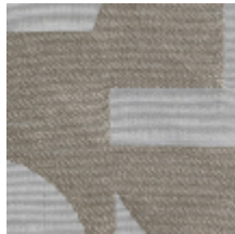
4223-03 STABILE - PIERRE *