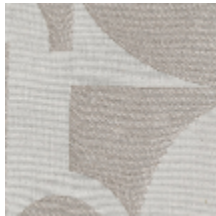
4223-02 STABILE - GALET *