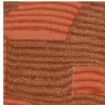
4223-04 STABILE - CUIVRE *