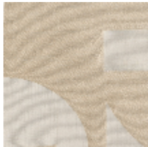
4223-01 STABILE - IVOIRE *