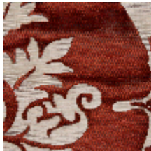
4234-02 BLASON - CORNALINE