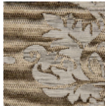
4234-04 BLASON - VERMEIL