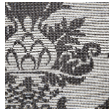
4234-05 BLASON - CENDRE