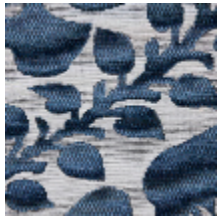
4234-01 BLASON - PRUSSE