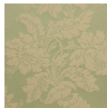
4237-06 VILLARCEAUX - AMANDE