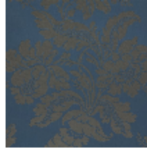
4237-04 VILLARCEAUX - NUIT