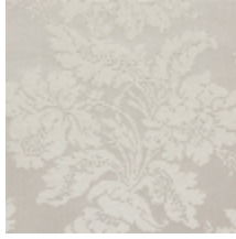
4237-02 VILLARCEAUX - ARGENT