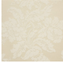
4237-01 VILLARCEAUX - IVOIRE