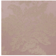
4237-07 VILLARCEAUX - POUDRE