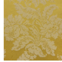
4237-05 VILLARCEAUX - OR