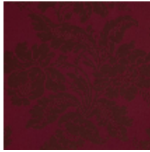
4237-08 VILLARCEAUX - RUBIS