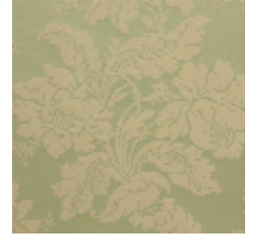
4237-06 VILLARCEAUX - AMANDE