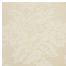
4237-01 VILLARCEAUX - IVOIRE