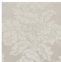
4237-02 VILLARCEAUX - ARGENT