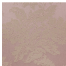
4237-07 VILLARCEAUX - POUDRE