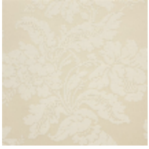
4237-01 VILLARCEAUX - IVOIRE