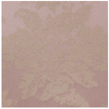
4237-07 VILLARCEAUX - POUDRE