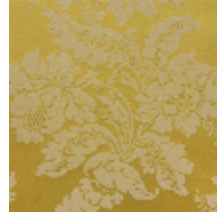
4237-05 VILLARCEAUX - OR