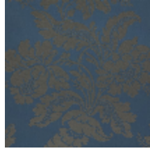
4237-04 VILLARCEAUX - NUIT