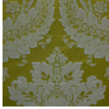
4240-02 VICTORIA - OLIVE