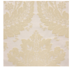
4240-06 VICTORIA M1 - POUDRE