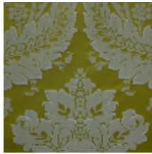
4240-02 VICTORIA M1 - OLIVE