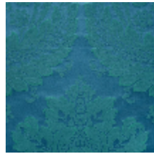
4240-03 VICTORIA M1 - CANARD