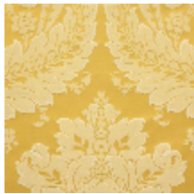
4240-07 VICTORIA M1 - OR