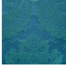
4240-03 VICTORIA M1 - CANARD