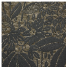
4241-02 VETIVER M1 - ENCENS