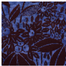
4241-01 VETIVER M1 - IRIS