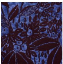
4241-01 VETIVER M1 - IRIS