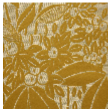
4241-03 VETIVER M1 - BERGAMOTE