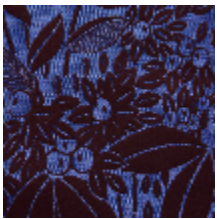
4241-01 VETIVER M1 - IRIS