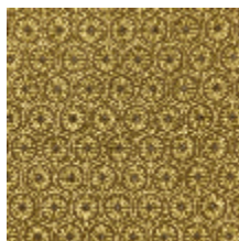
4243-03 MEDAILLON - MORDORE