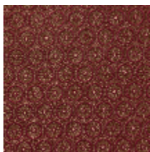
4243-01 MEDAILLON - CRAMOISI