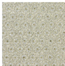
4243-04 MEDAILLON - VERMEIL