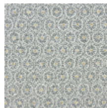
4243-05 MEDAILLON - EMAIL