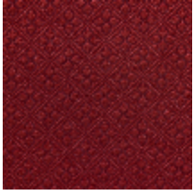
4244-01 BOSQUET - CRAMOISI