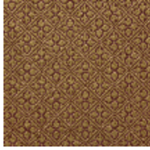
4244-02 BOSQUET - TABAC