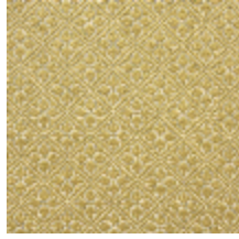
4244-03 BOSQUET - MORDORE