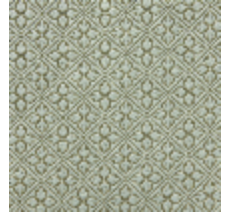
4244-06 BOSQUET - CELADON