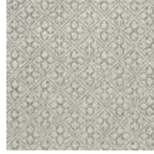
4244-05 BOSQUET - ARGENT