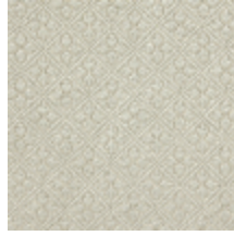
4244-04 BOSQUET - IVOIRE