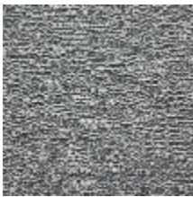
4246-02 ORÉE - GRANIT