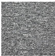
4246-02 ORÉE - GRANIT