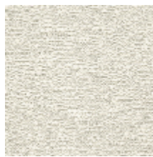
4246-04 ORÉE - PLATRE