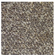
4246-01 ORÉE - LIEGE