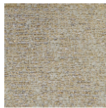
4246-05 ORÉE - GRES