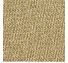
4248-06 DIAMANT - OR