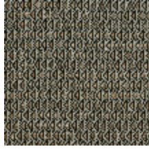
4248-03 DIAMANT M1 - GRAPHITE