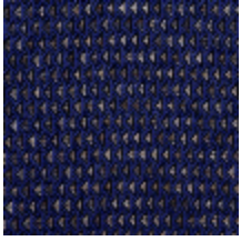
4248-01 DIAMANT - LAPIS