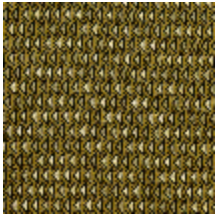
4248-07 DIAMANT - SOUFRE