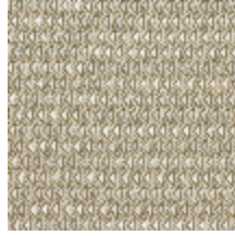
4248-04 DIAMANT - MICA