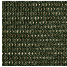
4248-09 DIAMANT M1 - SERAPHINITE