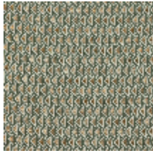
4248-08 DIAMANT M1 - JADE