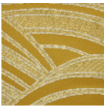
4250-02 DUOMO M1 - OCRE