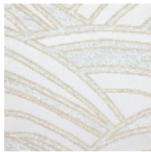
4250-03 DUOMO M1 - NACRE