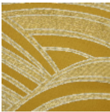
4250-02 DUOMO M1 - OCRE