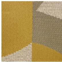
4252-02 DALAI - SOLEIL