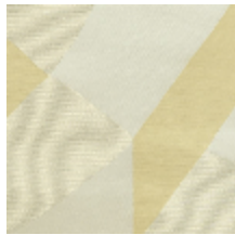
4252-03 DALAI - NATUREL