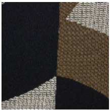
4252-01 DALAI - ECAILLE