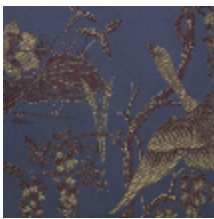
4253-02 LA PARADE DES OISEAUX-ORAGE