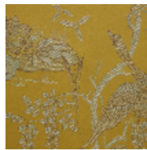
4253-04 LA PARADE DES OISEAUX-OR