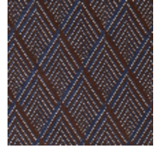
4256-06 ARIANE M1 - CHOCOLAT