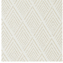
4256-01 ARIANE M1 - BLANC