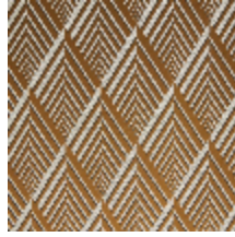
4256-04 ARIANE M1 - GAZELLE