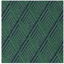
4256-07 ARIANE M1 - MENTHE