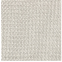
4257-01 PLATINE M1 - TITANE