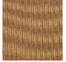
4257-06 PLATINE M1 - MORDORE