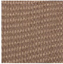
4257-08 PLATINE M1 - BRONZE