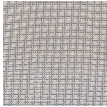
4257-09 PLATINE M1 - PALLADIUM