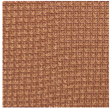
4257-07 PLATINE M1 - CUIVRE