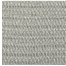
4257-10 PLATINE M1 - ZINC