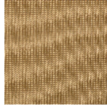
4257-05 PLATINE M1 - DORE