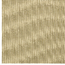
4257-03 PLATINE M1 - VERMEIL