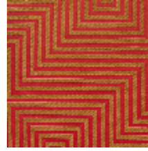
4258-04 HERA M1 - PAVOT