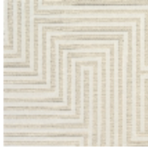
4258-02 HERA M1 - NATUREL