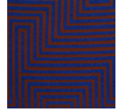
4258-06 HERA M1 - LAPIS