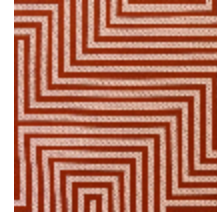
4258-05 HERA M1 - BOIS DE ROSE