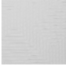
4258-01 HERA M1 - BLANC