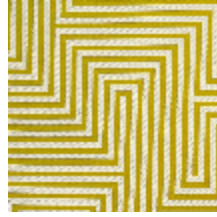
4258-03 HERA M1 - ABSINTHE