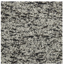
4259-01 BALTIC - POIVRE