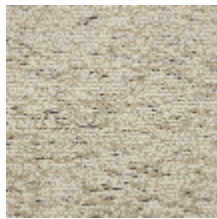
4259-03 BALTIC - SABLE