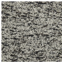
4259-01 BALTIC - POIVRE