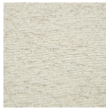
4259-04 BALTIC - ECRU