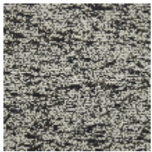
4259-01 BALTIC - POIVRE