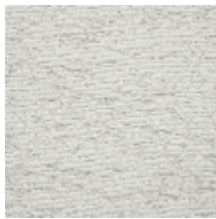
4259-02 BALTIC - FUMÉE