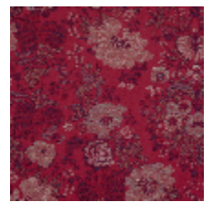
4261-06 FELICITÉ - GRIOTTE