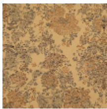
4261-01 FELICITÉ - DORÉ