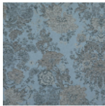
4261-03 FELICITÉ - NATTIER