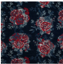
4263-02 RONSARD - ENCRE