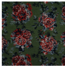
4263-03 RONSARD - PRAIRIE