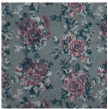
4263-01 RONSARD - POMPADOUR