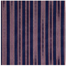
4264-07 HOULGATE - ENCRE