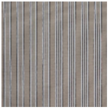
4264-13 HOULGATE - FICELLE