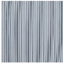
4264-14 HOULGATE - PERLE