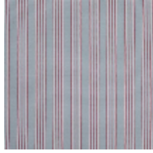
4264-03 HOULGATE - PORCELAINE