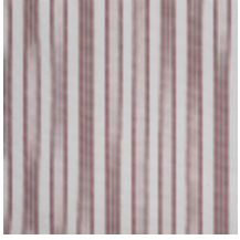
4264-01 HOULGATE - BOUDOIR