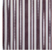
4264-06 HOULGATE - CHILLENNE