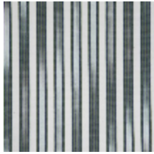
4264-08 HOULGATE - BUIS