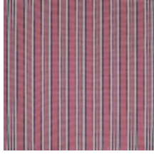
4264-02 HOULGATE - ROSE