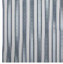
4264-04 HOULGATE - OPALE