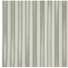
4264-09 HOULGATE - TILLEUL