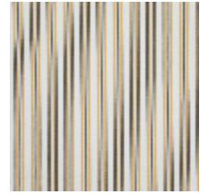
4264-12 HOULGATE - PAILLE