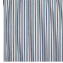
4264-05 HOULGATE - FAIENCE