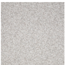
4268-01 LEONTINE - NATUREL