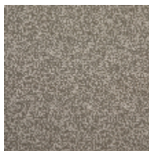
4268-03 LEONTINE - KAKI