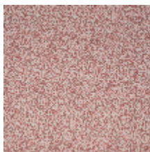
4268-02 LEONTINE - TOMETTE