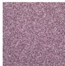
4268-05 LEONTINE - BOIS DE ROSE