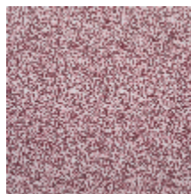
4268-04 LEONTINE - GRIOTTE