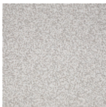
4268-01 LEONTINE - NATUREL