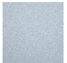
4268-06 LEONTINE - CIEL