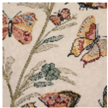
4270-01 FLANERIE - PRINTEMPS