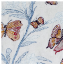
4270-02 FLANERIE - BOUDOIR