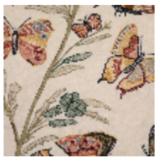
4270-01 FLANERIE - PRINTEMPS