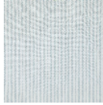
4290-04 COMTESSE - NATTIER