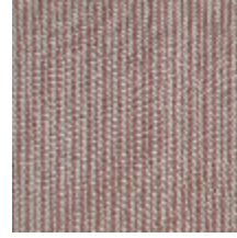
4290-05 COMTESSE - PETALE