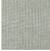
4290-03 COMTESSE - AMANDE