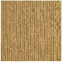
4290-07 COMTESSE - MORDORE