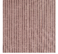
4290-06 COMTESSE - VIOLINE