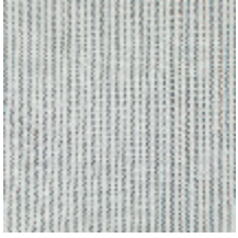
4290-01 COMTESSE - ONYX