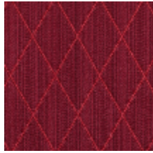
0484-09 FILIN - CARMIN