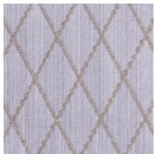
0484-13 FILIN - MAUVE