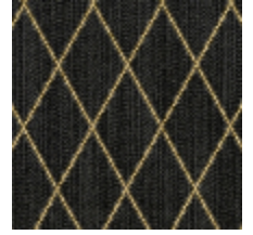
0484-06 FILIN - ONYX