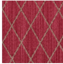
0484-10 FILIN - GIROFLEE