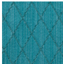
0484-16 FILIN - MALACHITE