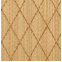
0484-01 FILIN - PEPITE