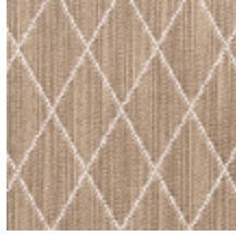
0484-03 FILIN - DUNE