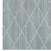
0484-05 FILIN - ARGENT