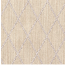
0484-02 FILIN - IVOIRE