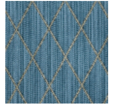
0484-12 FILIN - ARDOISE