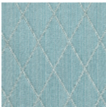
0484-14 FILIN - NATTIER