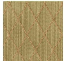
0484-18 FILIN - CHARTREUSE