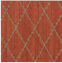
0484-08 FILIN - CUIVRE