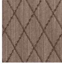
0484-04 FILIN - SYCOMORE