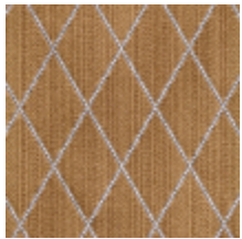
0484-19 FILIN - GOLD