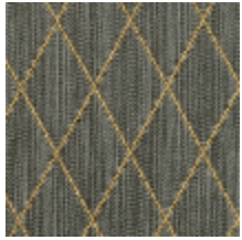
0484-07 FILIN - ACIER