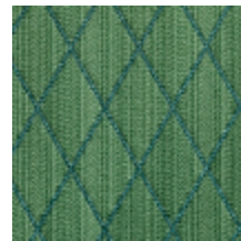
0484-17 FILIN - FORET