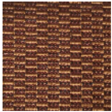
0496-13 KOZO - AMBRE *