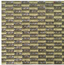
0496-15 KOZO - MOUSSE *