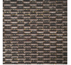
0496-11 KOZO - TAUPE *