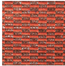
0496-17 KOZO - ROUX *