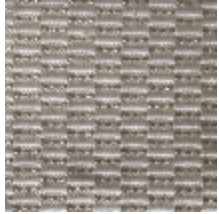
0496-01 KOZO - IVOIRE *