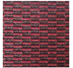
0496-19 KOZO - BIGARREAU *