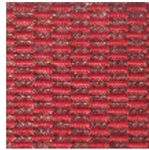
0496-18 KOZO - THÉÂTRE *